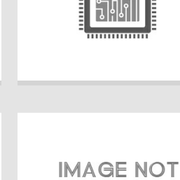
IMAGE NOT Description: M68AW031AL70MS6 ST SOJ-28L AVAILABLE Manufacturers: ST

Manufacturers: STM In Stock: New original, 1000 pcs Stock Available. RFQ Quote: