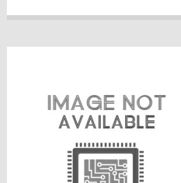
Description: VNS1NV04DPT ST SOP8 Manufacturers: ST In Stock: New original, 100 pcs Stock Available.